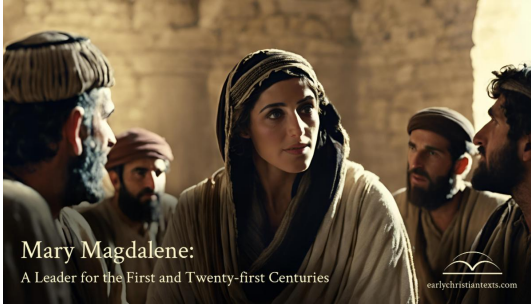
Mary Magdalene: A Leader for the First and Twenty-first Centuries