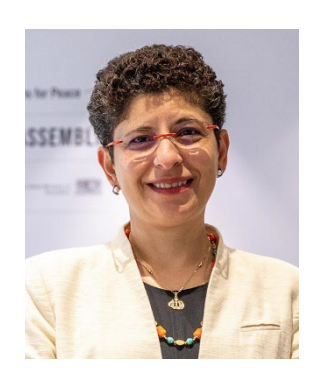
1-2:30 PM (PST) Voices of Women: Building Human Solidarity

"Building Human Solidarity: The Voices of Women of Faith." Azza Karam, Secretary General, Religions for Peace